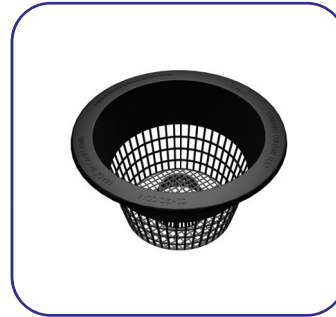
CCH2O NET POT 8