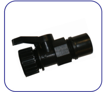
DRAIN VALVE KIT