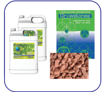
CULTURED SOLUTIONS VEG A/B & GROWSTONE

Current Culture H2O would like to thank you for purchasing a UC Solo, Single Module Water Culture System. Follow these simple instructions and you will be growing trees in no time!