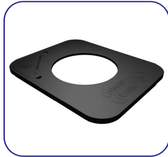
CCH2O LID 8