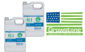
CULTURED SOLUTIONS & GROWSTONE