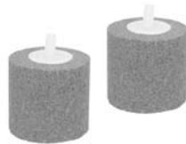
MEDIUM ROUND AIRSTONES