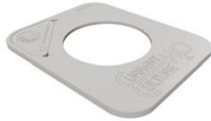
CCH2O LID 8