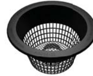
CCH2O NET POT(S)