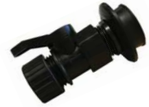
DRAIN VALVE KIT